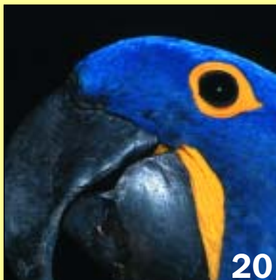
Zalmir Silvino Cubas