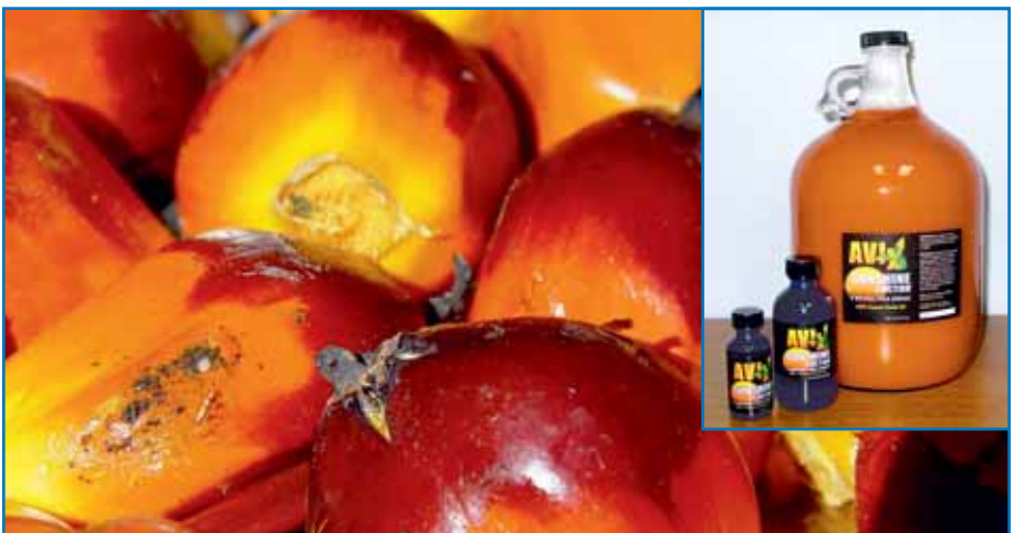
Organic red palm fruit from Brazil, not Malaysia